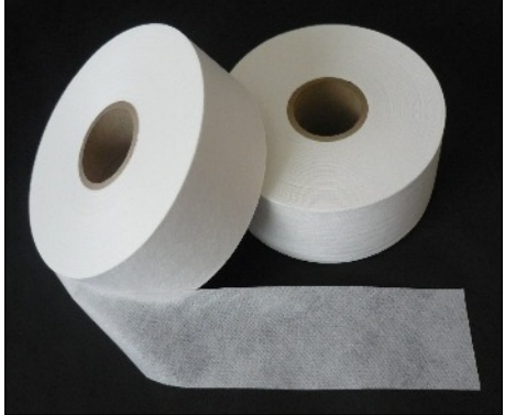
Syntex SLA 45 in slit roll form